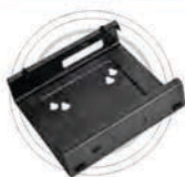
ThinkCentre® Tiny VESA® Mount