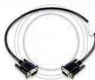
Lenovo® 0.5 meter VGA to VGA Cable