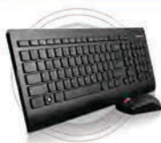
Lenovo® Ultralim Wireless Keyboard and Mouse Combo