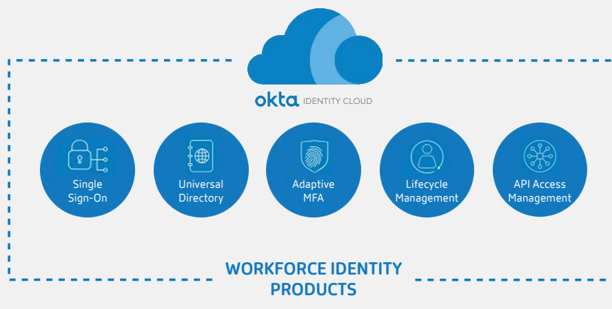
Figure 1. Okta provides a comprehensive workspace identity solution.