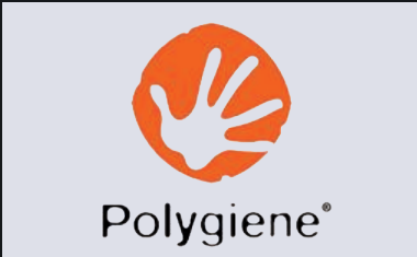
Antimicrobial Surface effectively protects against microbes