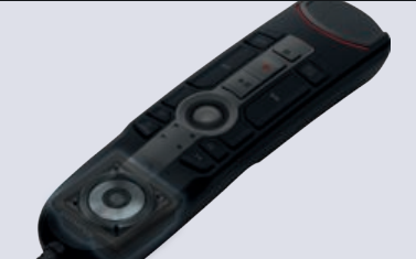
Closed Loudspeaker Chassis generates good sound quality