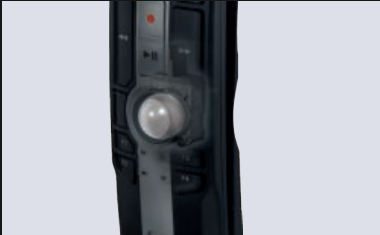
Trackball with smart Cursor Motion

Even in noisy environments. Intelligent Two-Microphone System Noise Cancellation