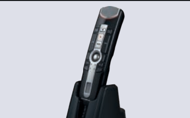
Microphone Stand with automatic Stand Detection allows for hands-free dictation