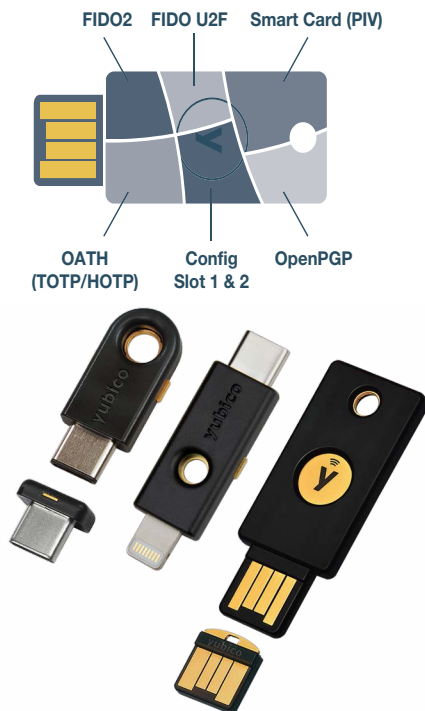
Figure 2. YubiKey 5 Series supports multiple protocols in a range of form factors

The YubiKey 5 Series is a family of multi-protocol security keys enabling expanded use cases for strong two-factor, multifactor, and passwordless authentication. The YubiKey 5 Series keys support FIDO2/WebAuthn, FIDO U2F, one-time password (OTP), and smart card, and provide a choice of form factors for desktop, laptop, and mobile (Figure 2). For passwordless authentication, the YubiKey 5 Series acts as a hardware authenticator, delivering strong single-factor authentication to replace weak passwords as part of a rapid but secure tap-and-go experience (Figure 3).