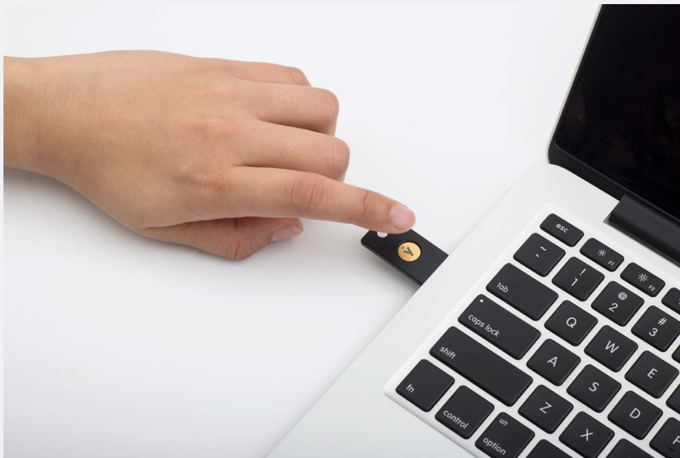
Figure 3. YubiKey 5 Series offers tap-and-go access to Citrix Workspace