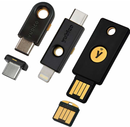
Figure 2. YubiKey 5 Series form factors (Note to reviewers: need high-res image)